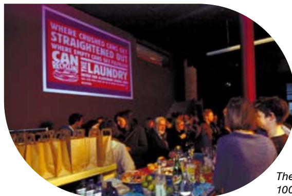
The Laundry celebrates reaching the 1000 customer mark in 2007