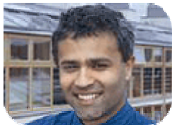
One Planet Communities Director and Co-founder of BioRegional