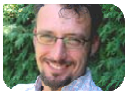
Executive Director, BioRegional North America (week 3)